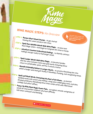
Kit Overview Card