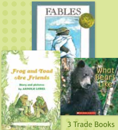
3 Trade Books