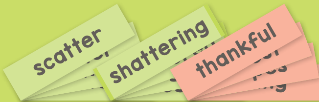
Three sets - 175 cards total